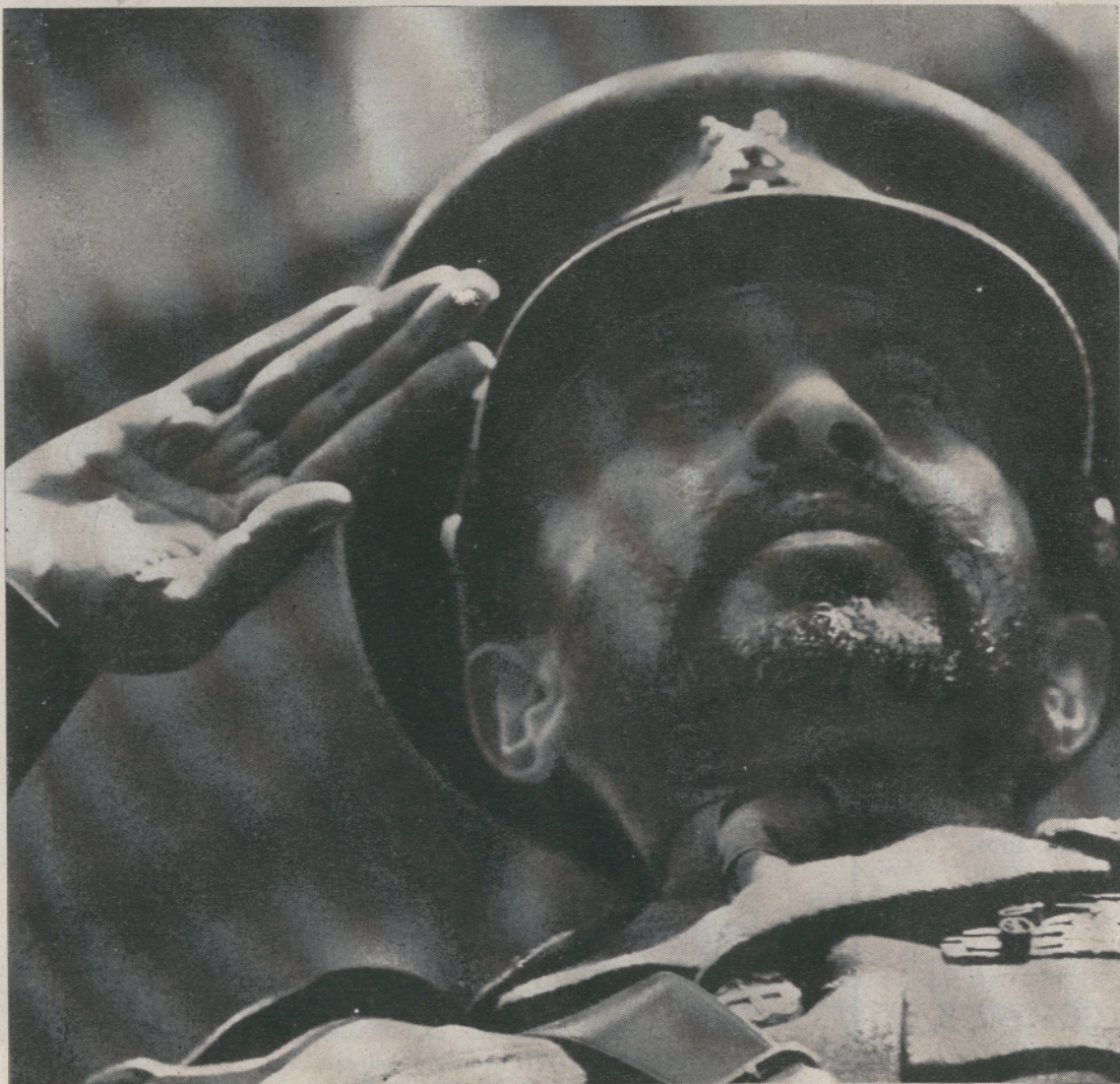
THE EMPEROR SALUTES AS FIRST ARMY BAND STRIKES UP "MAZMUR," ETHIOPIA'S NATIONAL ANTHEM