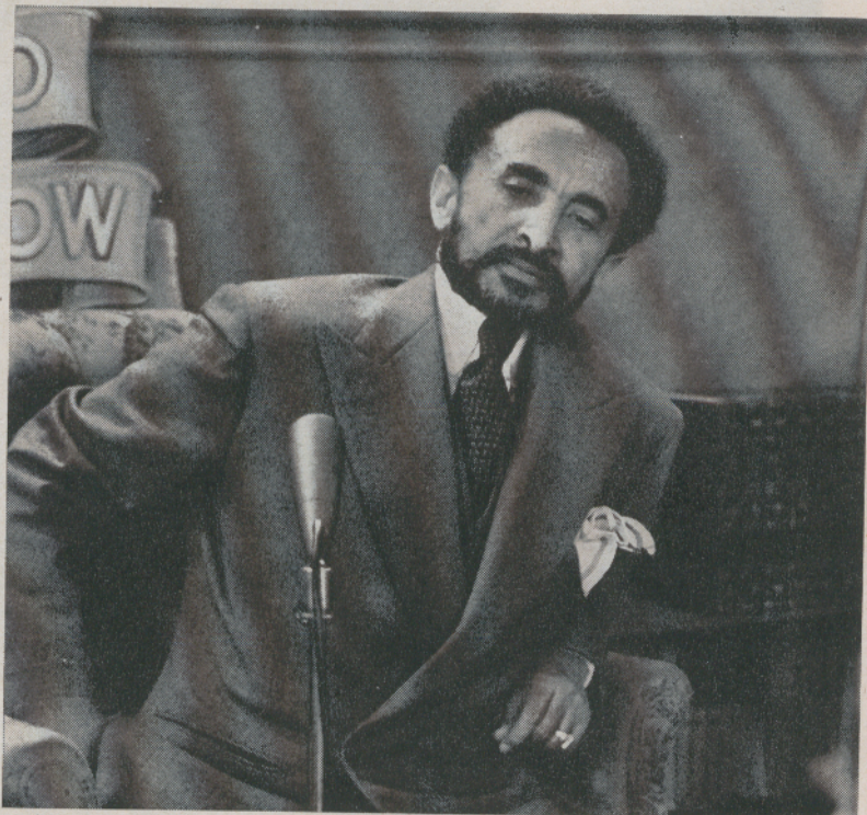
IN WASHINGTON the emperor makes a recording for the television show Youth Wants to Know . Film was shown over nationwide network next day.