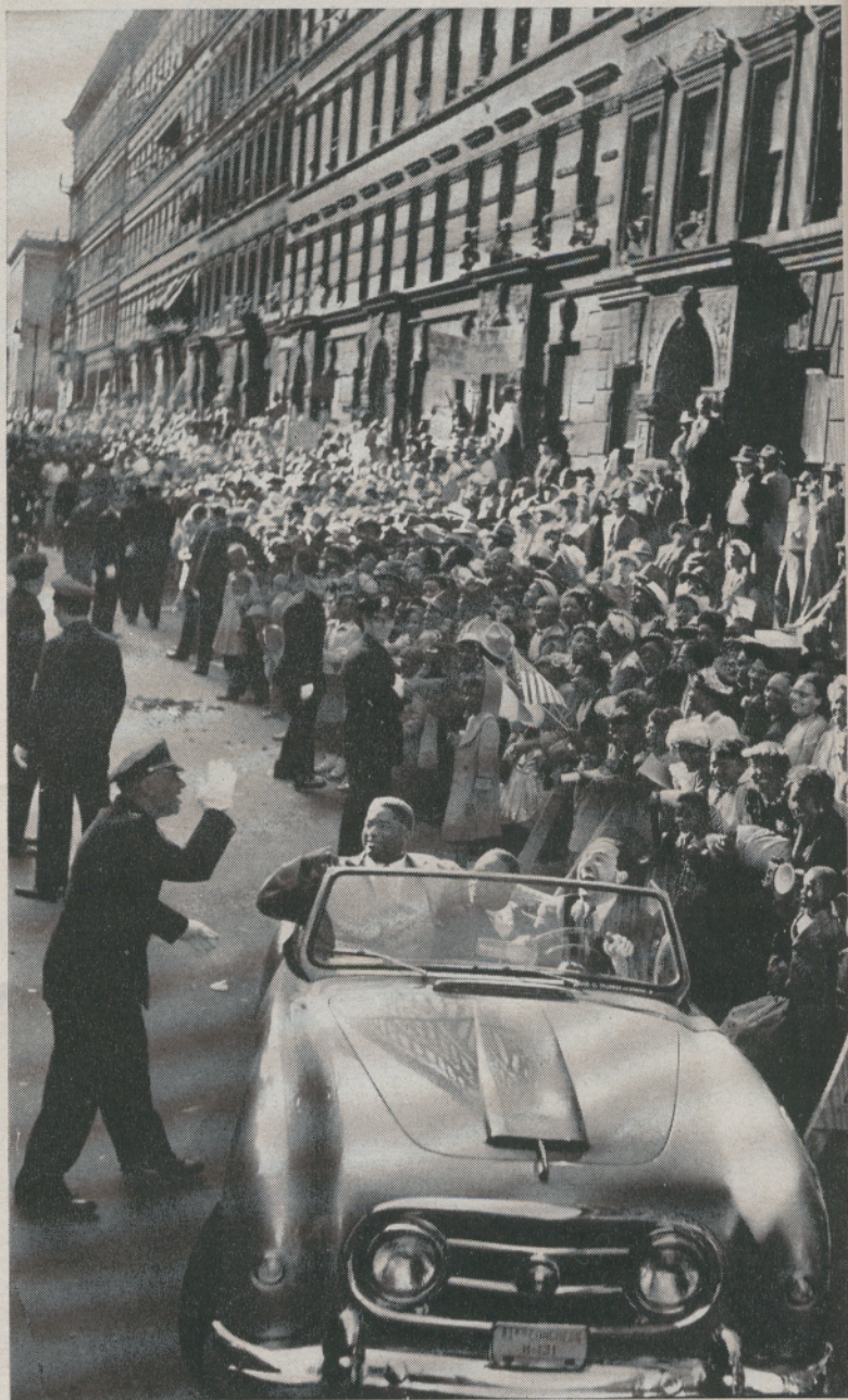
TUMULTUOUS SEND-OFF awaits His Majesty as his cavalcade, led by Congressman Rev. Adam Clayton Powell (driving car), pulls away from the Abyssinian Baptist Church. Representative Powell is minister of the church.